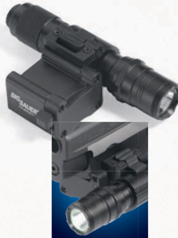
STL-100C Mini Tactical