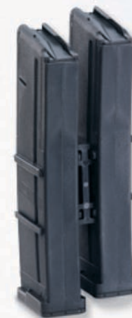
Double AR 30 Round (SIG556®) Magazines