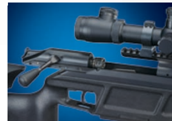
Straight pull action