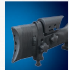
Adjustable butt plate and check piece