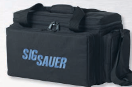
SIG SAUER® Competition Range Bag

Made of 600 Denier black woven polyester with blue embroidered SIG SAUER® logo.