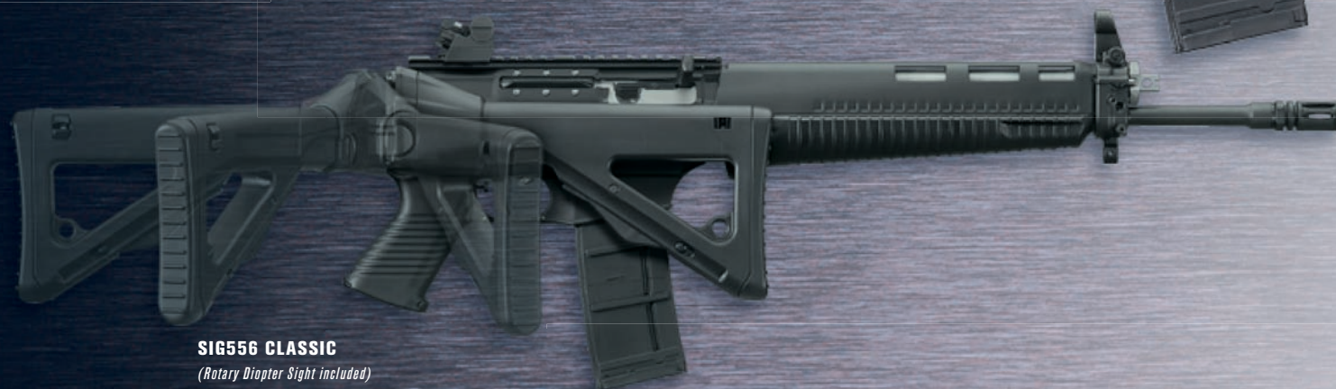
SIG556 CLASSIC (Rotary Diopter Sight included)