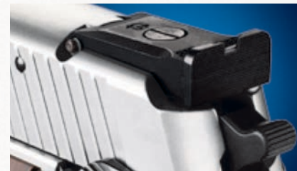
Adjustable target sight

shooters with surgical accuracy and reliability. Each pistol is specifically engineered to give the shooter superior balance for rapid follow-up shots, crisp triggers for predictable shot breaks, and funneled grips for smoother magazine changes. Knowing that competitors have the highest expectations of target pistols bearing the SIG SAUER brand, each model is specifically tuned for class, including two new U.S. Practical Shooting Association models.