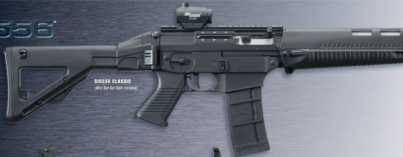
SIG556 CLASSIC (Mini Red Dot Sight included)