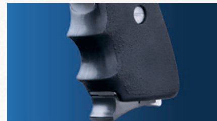
Hogue® finger-groove grip

TRIGGER: DA/SA SIGHTS: Post and dot contrast sights or SIGLITE night sights SLIDE FINISH: Nitron FRAME FINISH: Black hard coat anodize CALIBERS: .380ACP (9mm Short) FEATURES: Ultra-slim profile for concealment Excellent balance 4 point safety system