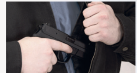
Designed for easy concealment