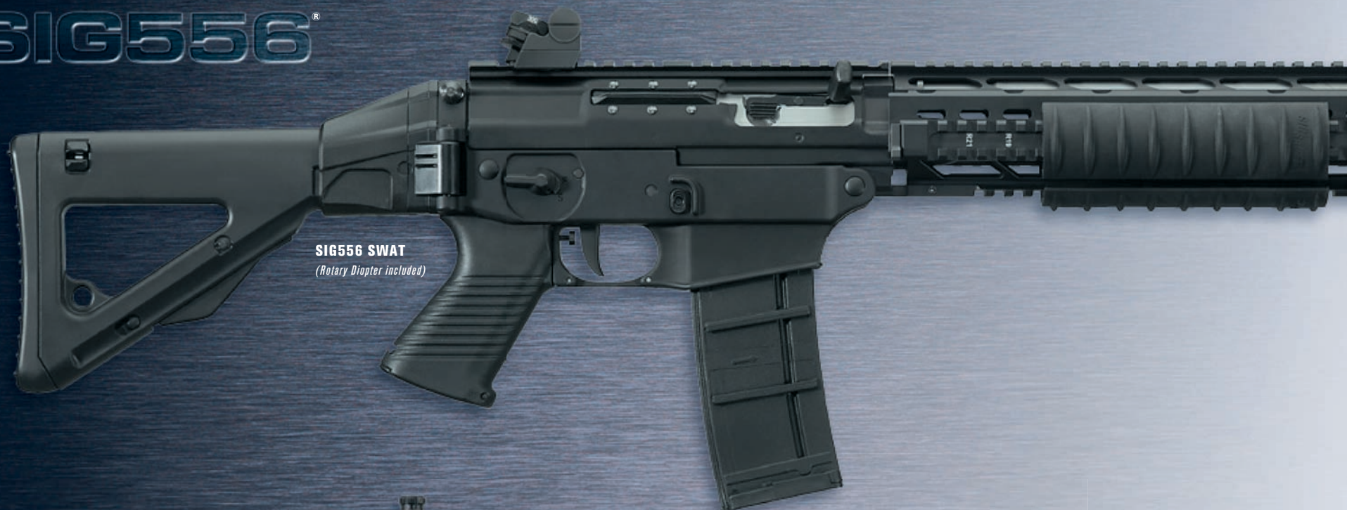
SIG556 SWAT (Rotary Diopter included)