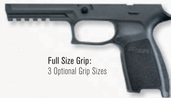
Full Size Grip: 3 Optional Grip Sizes