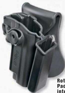
Roto Retention Paddle Holster with integrated magazine pouch.