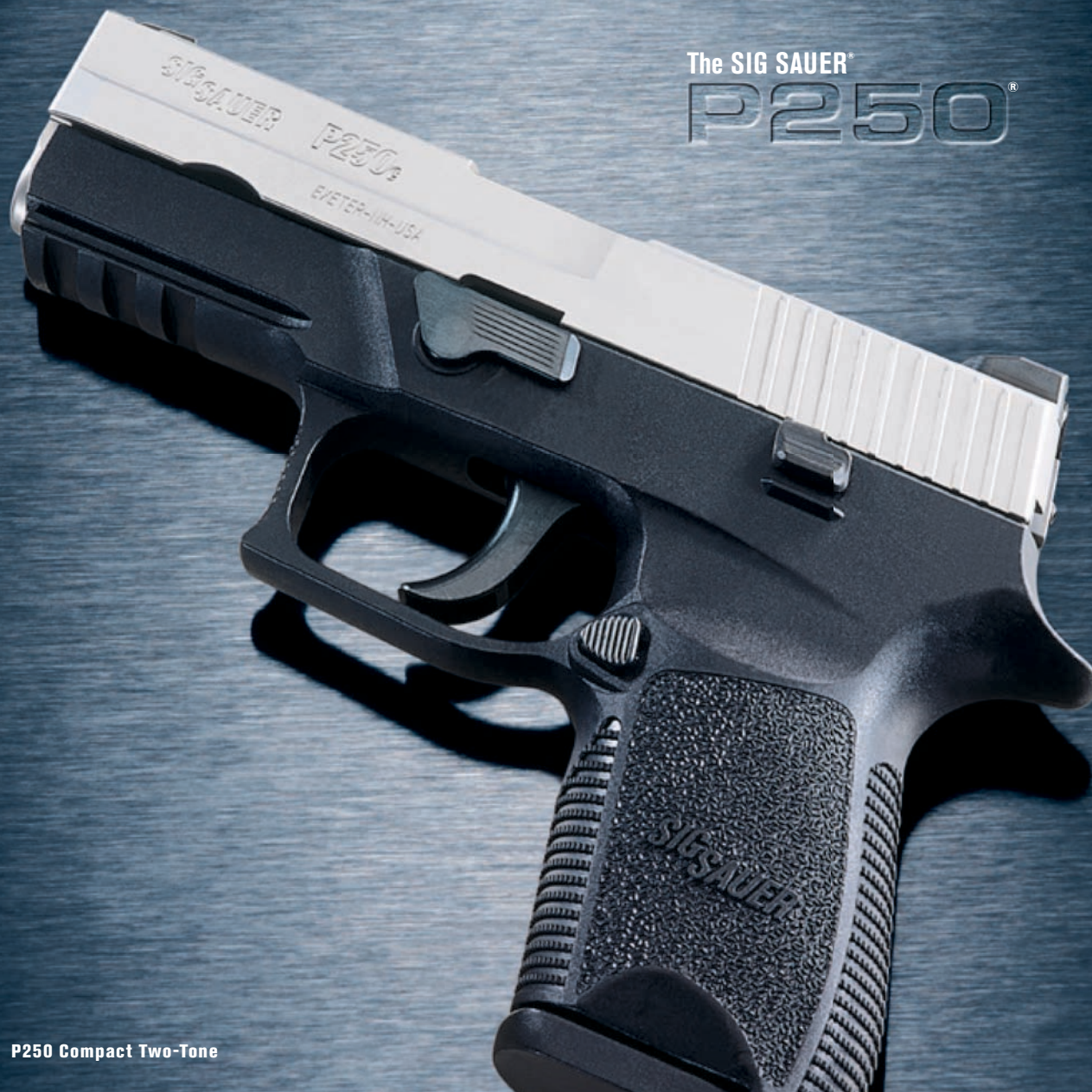
P250 Compact Two-Tone