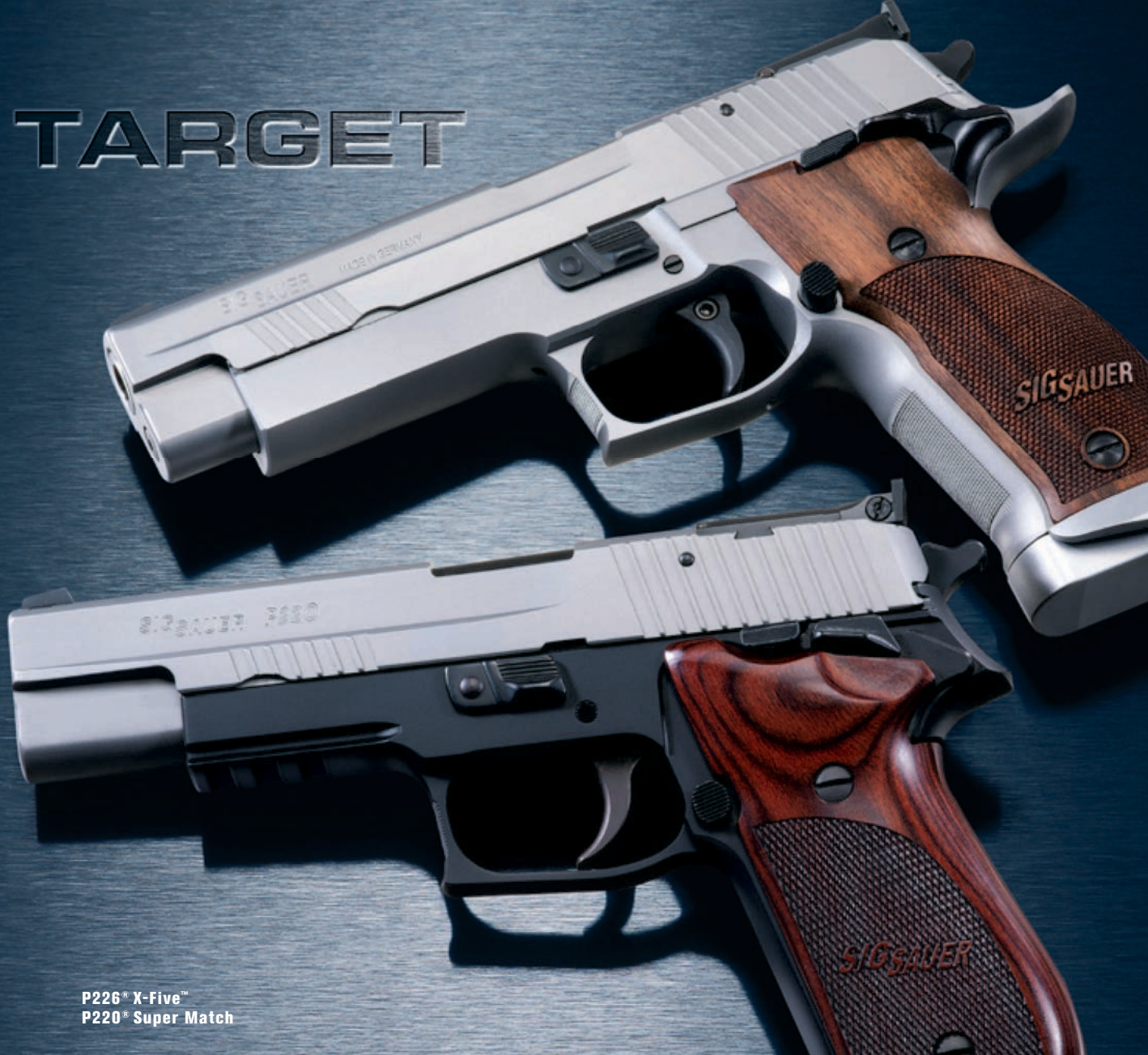
P226* X-Five™ P220* Super Match

WHETHER GOING AFTER A TITLE OR JUST SHOOTING FOR FUN, target shooters will find a SIG SAUER® pistol to take their skills and enjoyment to the highest level.