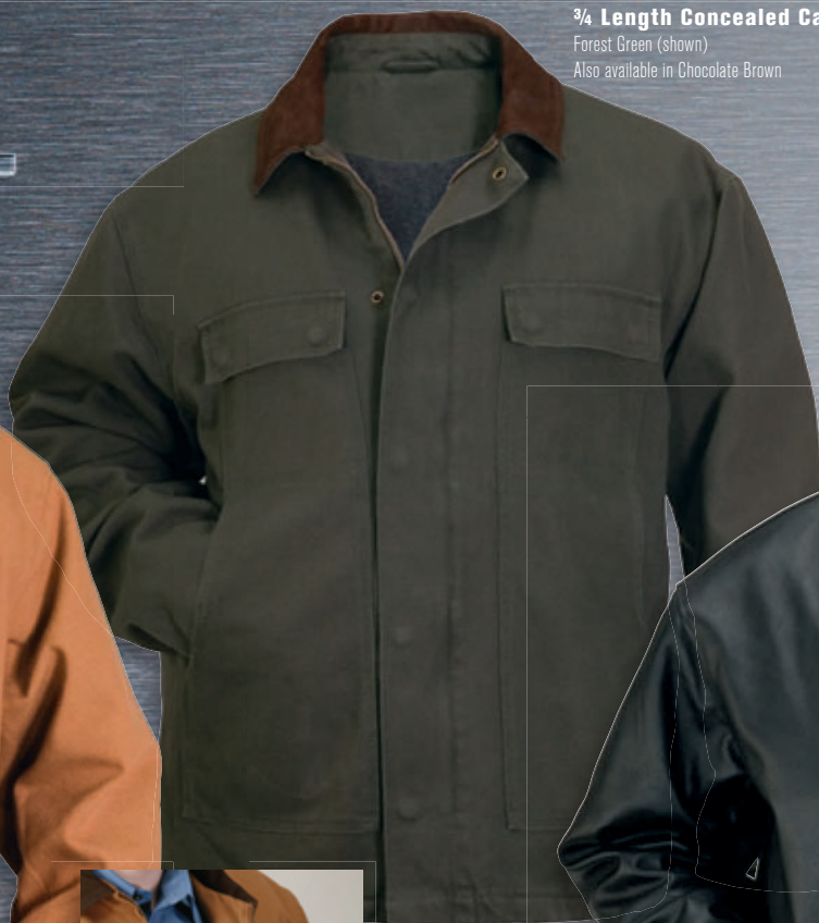
3/4 Length Concealed Carry Coat Forest Green (shown) Also available in Chocolate Brown