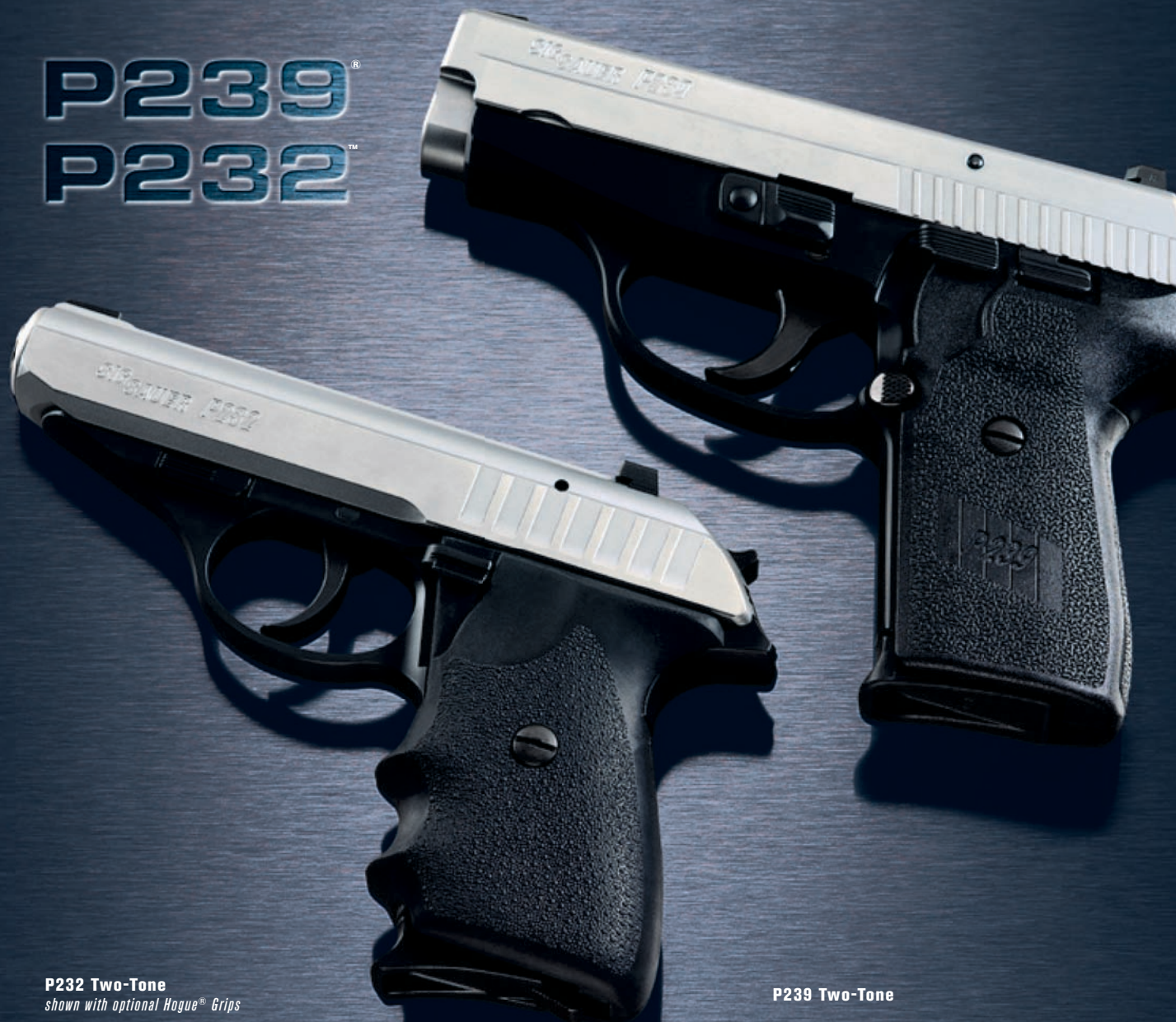
P232 Two-Tone shown with optional Hogue ® Grips