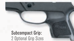
Subcompact Grip: 2 Optional Grip Sizes