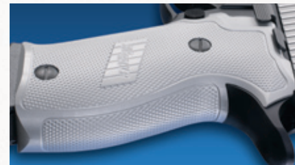
P220 Platinum Elite aluminum grip

shooting schedule. Rounded edges prevent snagging, while the textured grips ensure a secure surface for confident handling. Often regarded as "the best out-of-the-box" .45-caliber, the P220 family is now joined by a dedicated .22-caliber member.