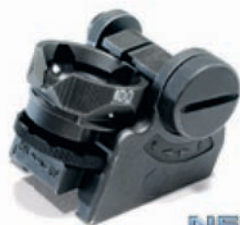
NEW Rotary Diopter sight

New for this year is the introduction of the SIG556 Classic model. The Classic name is based on the rifle's Swiss heritage and the classic features that it draws from those world famous Swiss rifles. The