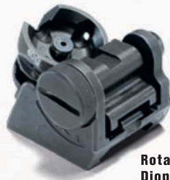
Rotary Diopter Sight