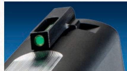
TRUGLO® Tritium fiber optic front sight

P226 Blackwater Tactical represents the ranks of those who provide professional support. Training is enhanced with the addition of the P226 Classic chambered in .22LR, offering a low cost alternative for each round fired. Function, weight, and feel are never sacrificed as SIG SAUER® responds to the growing need for alternative training innovations.