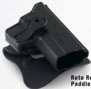
Roto Retention Paddle Holster