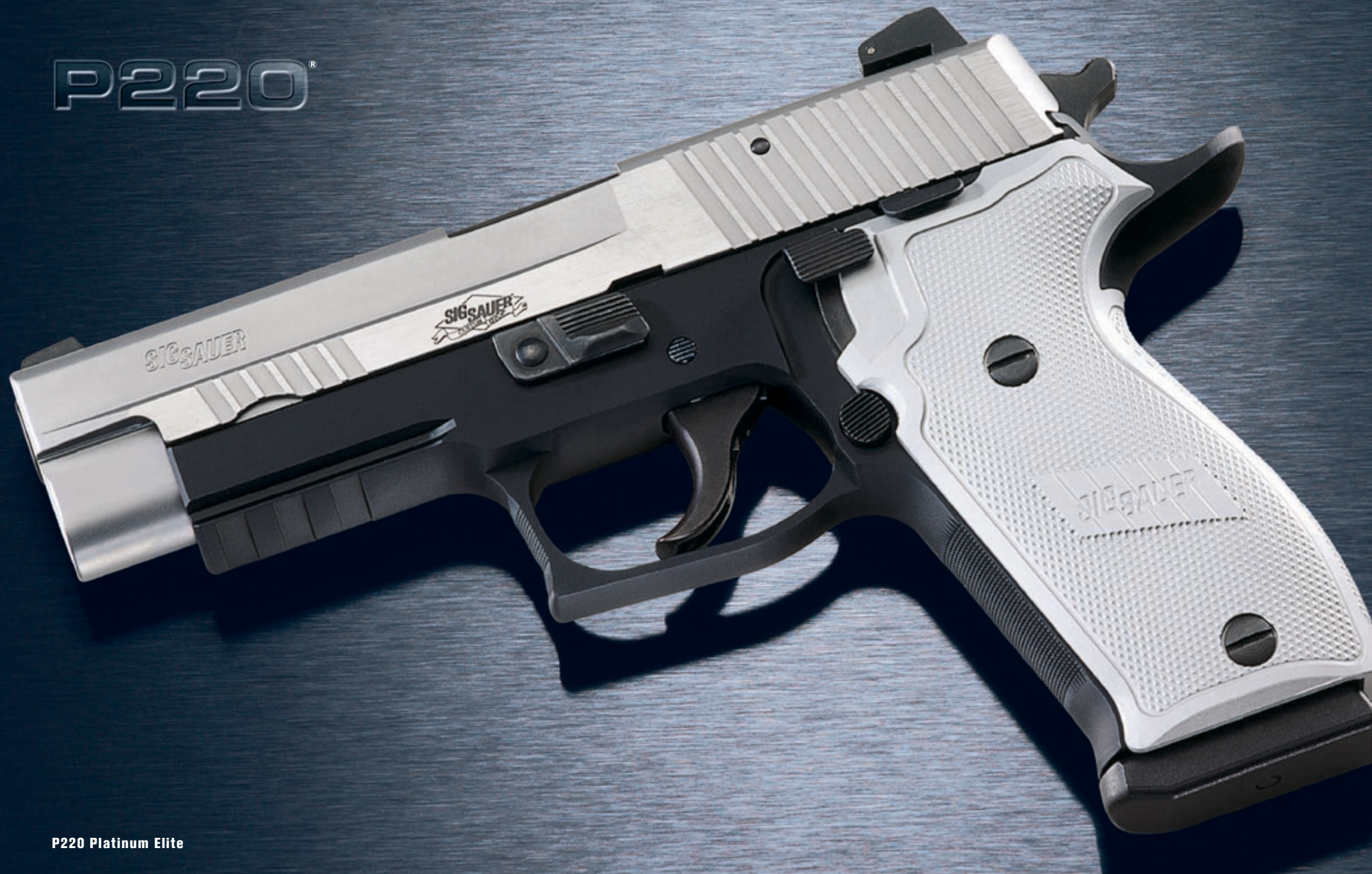
P220 Platinum Elite

STILL THE ONE TO BEAT. If you're looking for a definition of SIG SAUER ® 's well-known unfailing reliability, look at the P220. This is the pistol that can fire off 10,000 rounds in a day, without a single failure. It is the one that earned the trust of professionals who demanded a .45ACP that would always come through when the stakes were high.