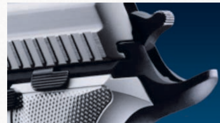
Ergonomically designed beavertailed frame (Elite)

The P229 family grows with the addition of the 2nd Generation SAS, the Classic .22, and the suppressor-capable Dark Elite. Crafted to handle more calibers, the Classic .22 continues the P229's reputation by offering a more affordable training tool without compromising function and feel. Dehorned edges, intuitive controls, and versatile features make the P229 perfectly suited for law enforcement and personal defense responsibilities.