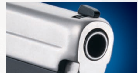
Rounded snag-free edges on slide