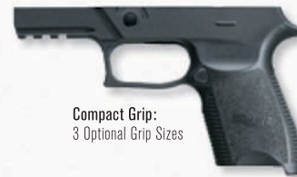
Compact Grip: 3 Optional Grip Sizes