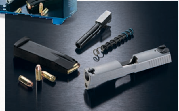
P250 Caliber X-CHANGE™ Kit