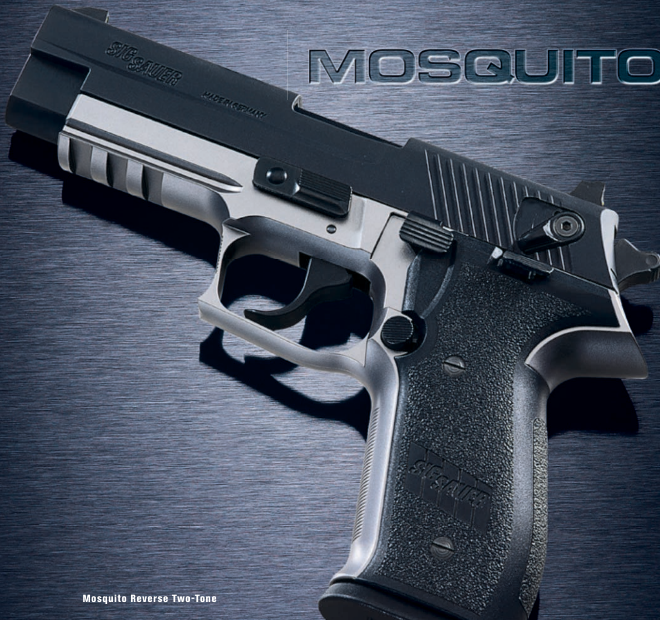
Mosquito Reverse Two-Tone