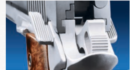
1911 Ambidexterous safety