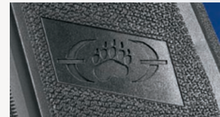
Blackwater® tactical grip