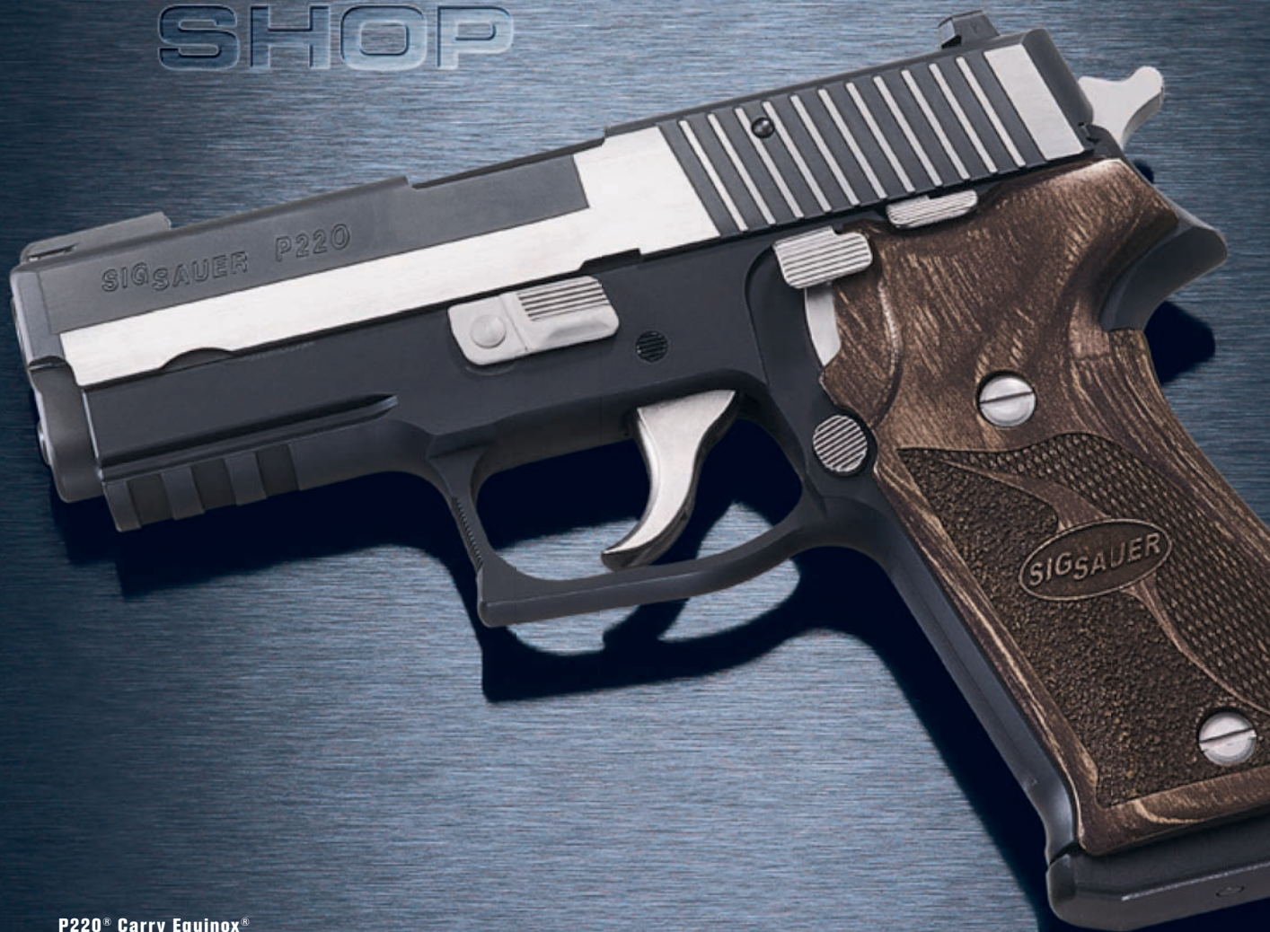
P220® Carry Equinox®