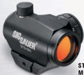
STS-081 Mini Red Dot Sight