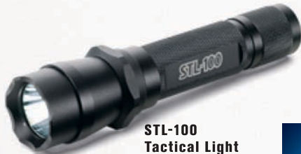
STL-100 Tactical Light