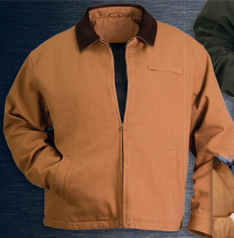
Concealed Carry Coat Tobacco (shown) Also available in Black and Chocolate Brown