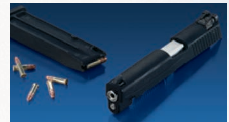
P220 Rimfire Conversion Kit