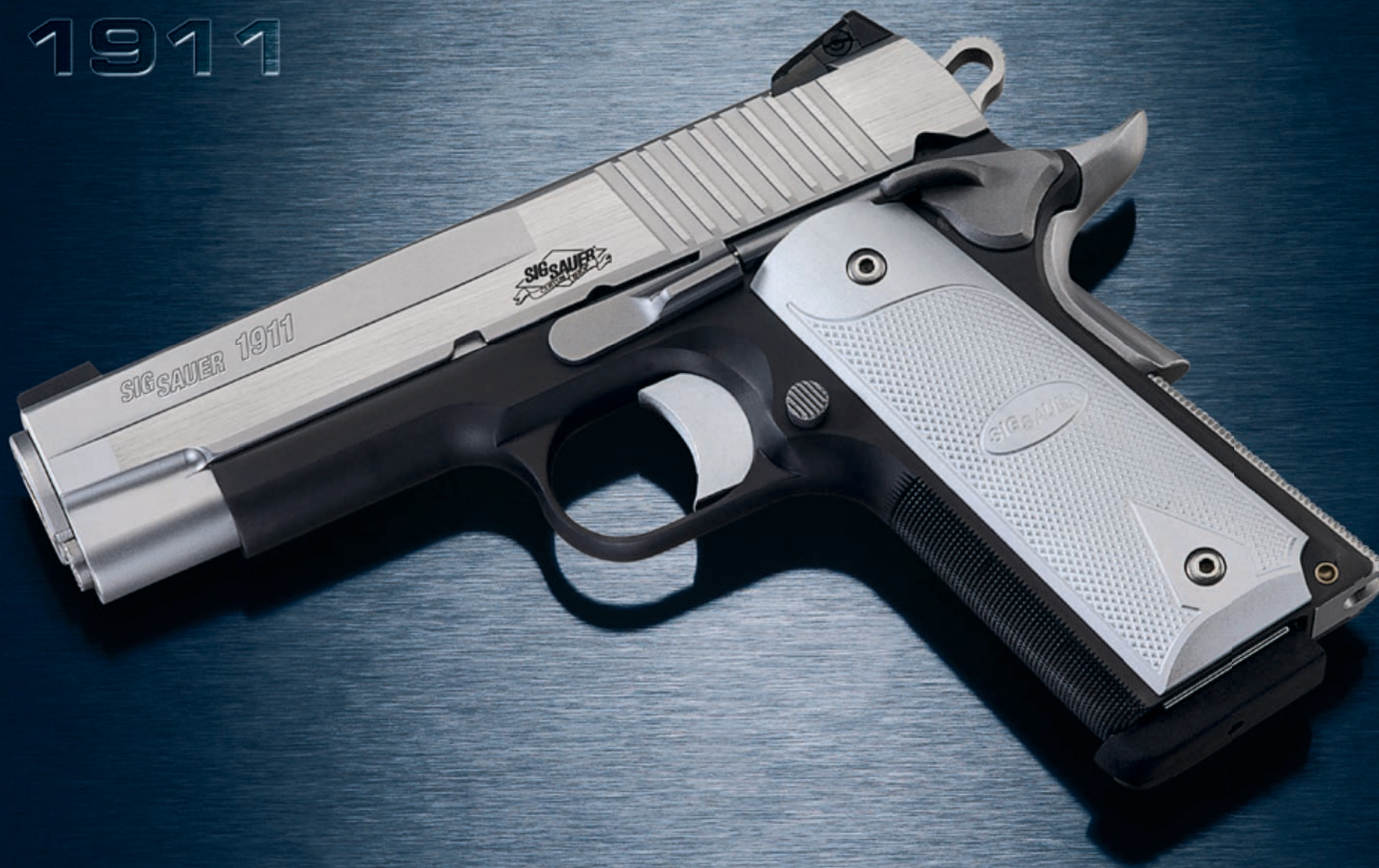
1911 Platinum Elite Carry

TO MEET THE DEMAND FOR 1911 ACCURACY AND RELIABILITY IN SMALLER PACKAGES, SIG SAUER® extended the series to include pistols scaled down for concealed carry, while still preserving shooting comfort.