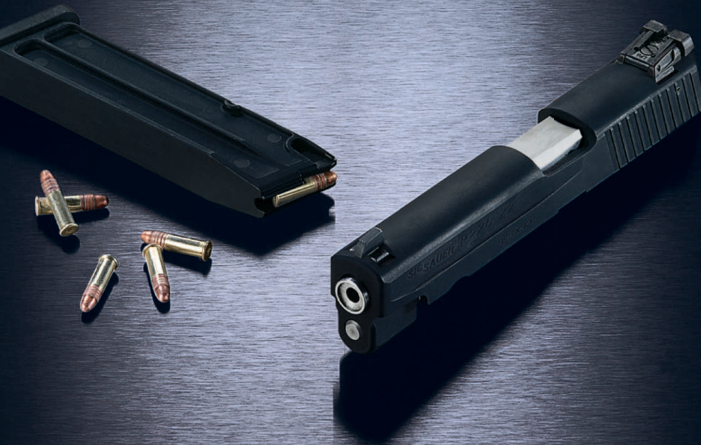
Rimfire Conversion Kit