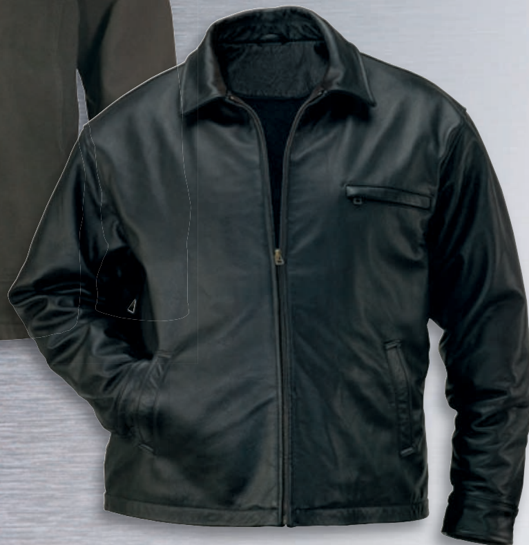
Leather Concealed Carry Coat Black (only)

All three styles are lined with 300-gram fleece and offered in sizes Medium to 2XL.