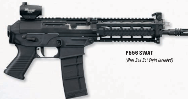
P556 SWAT (Mini Red Dot Sight included)