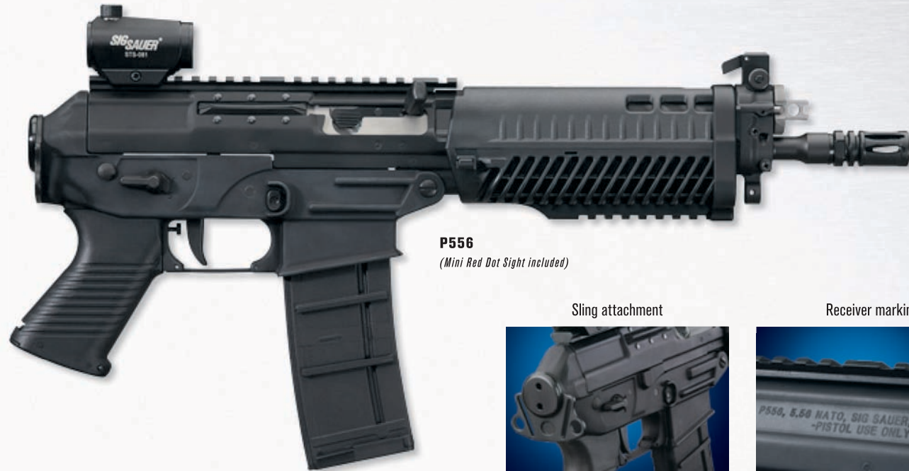
P556 (Mini Red Dot Sight included)

5.56 x 45mm NATO ammo and sports a 10" cold hammer forged barrel with a .5 x 28 TPI thread pattern flash suppressor. An M1913 accessory rail runs along the top of the P556 receiver to accept various sighting options and attachments. Both models feature the mini red dot optical sight. The SWAT version features an alloy quad rail for greater accessory mounting options.