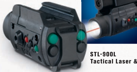
STL-900L Tactical Laser & Light