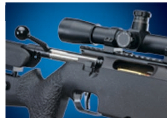
SSG 3000 six-lug lock-up

Tactical operations around the world have called on the service of the SSG 3000 for critical situations. SSG 3000 is a professional grade engagement system that exceeds the demands of police and military users. Sub M.O.A. performance is standard with match grade ammunition, as is the composite stock that allows the operator to fully adjust the rifle's fit. The 60-degree short throw bolt handle, safety, and magazine release are easily accessed without disrupting the shooter's position. Repeatable performance is achieved through a bedded action, adjustable trigger, and the strength of six locking lugs that secure the bolt to the barrel.